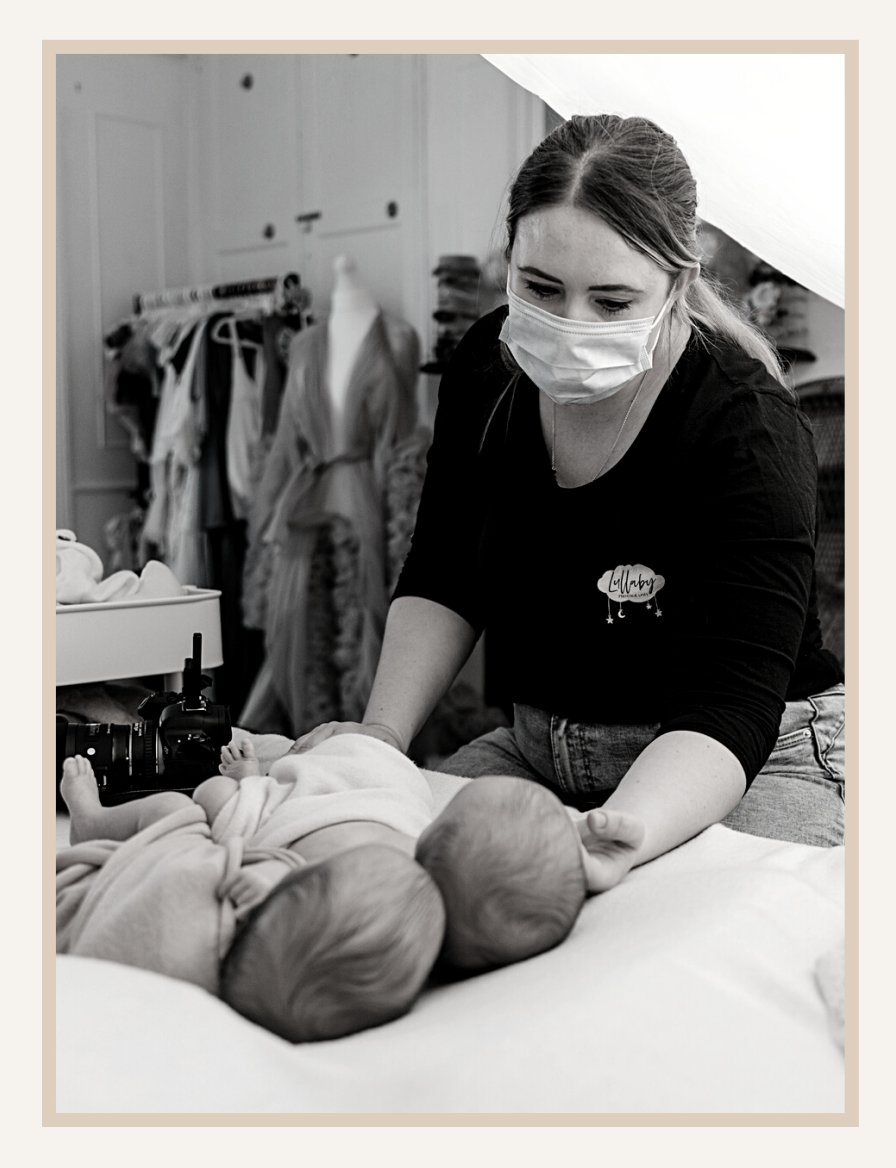
Memory preserver & baby whisperer